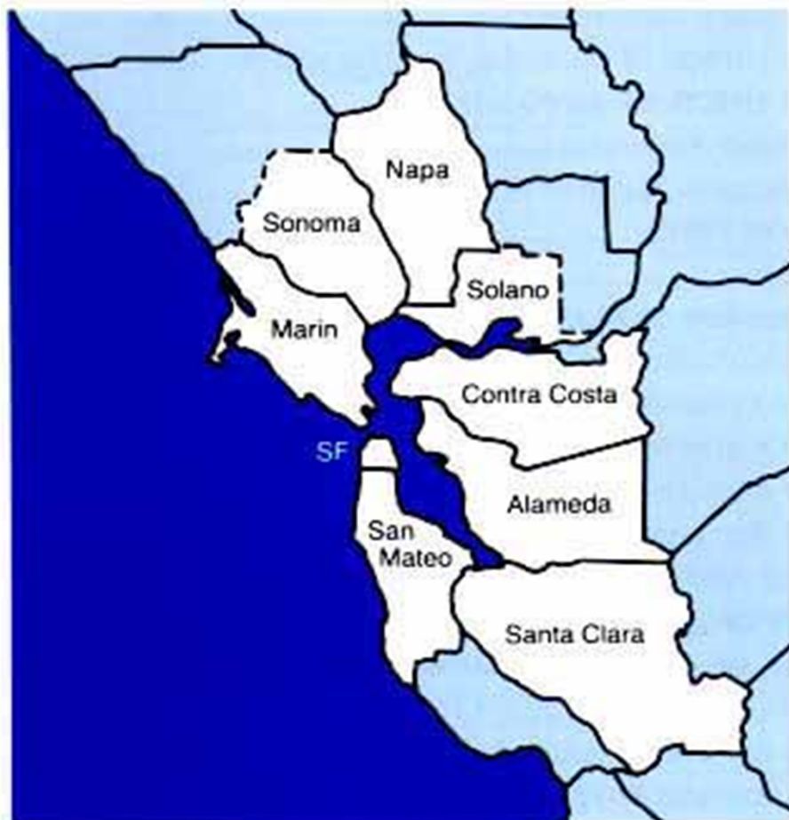
NINE COUNTY JURISDICTION OF THE BAAQMD